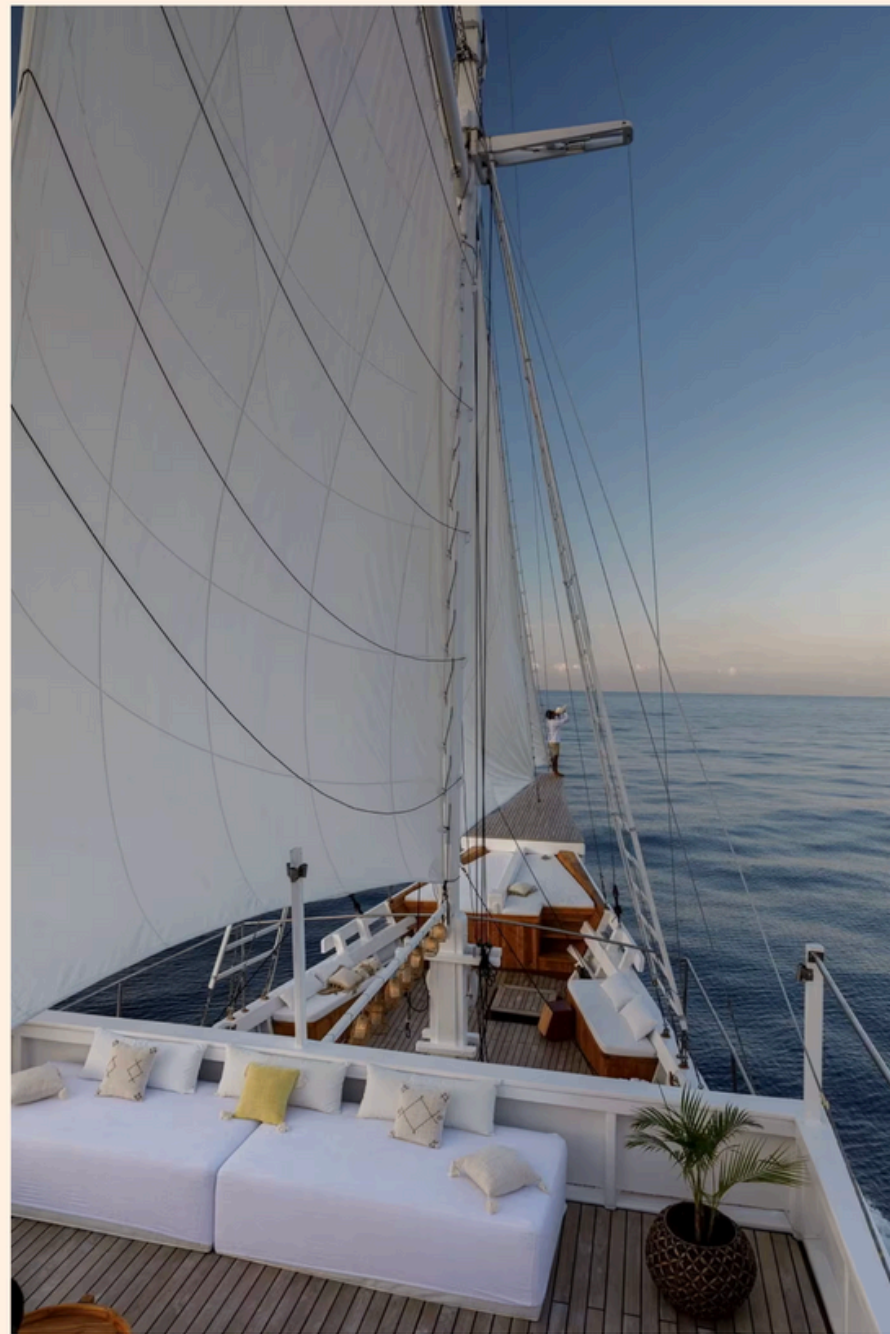
Set sail on the Aliikai...